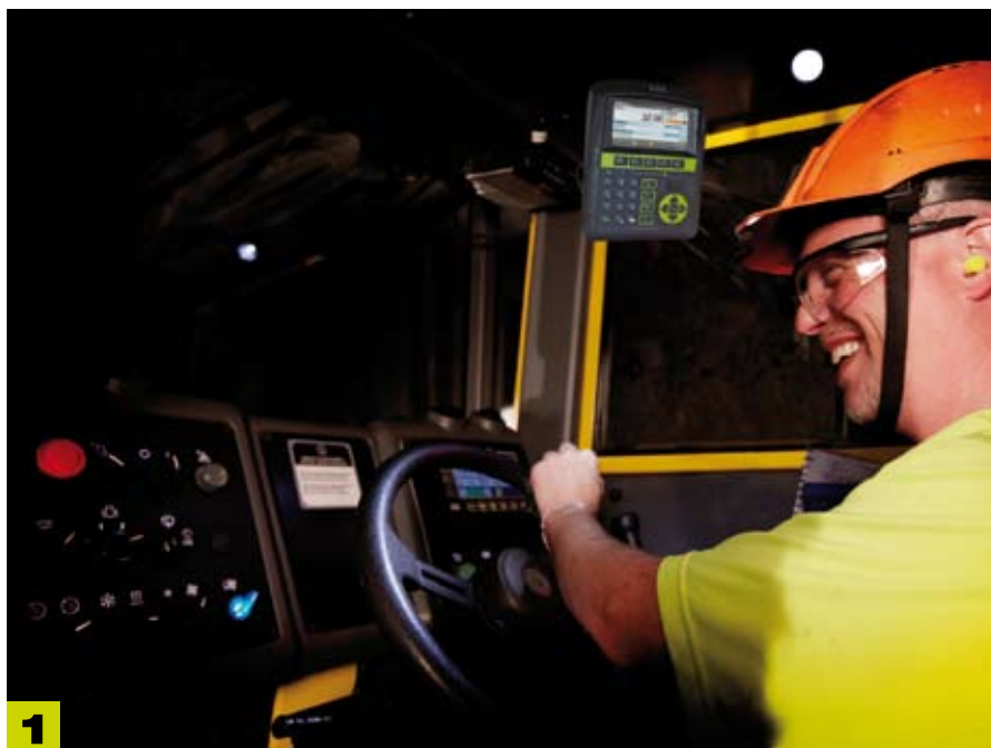
1 onboard instrumentation millennium5