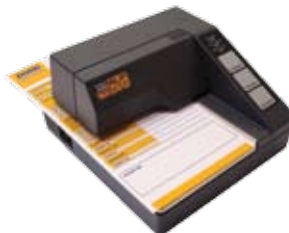
Slip printer Slip dot matrix printer

eprint: resistant thermal printer to quickly print delivery tickets