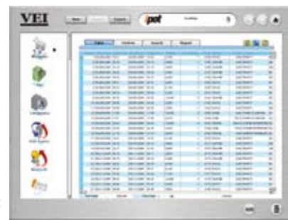
iPot , payload management software