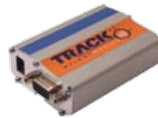
TrackWeight Mobile Quad-band cellular modem