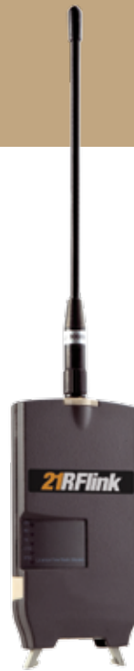
21RfLink 868Mhz radio modem